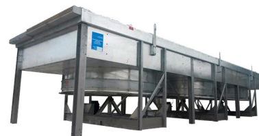
Chart Industries 5550 E Independence St. Tulsa, OK 74115 © 2022 Chart Industries