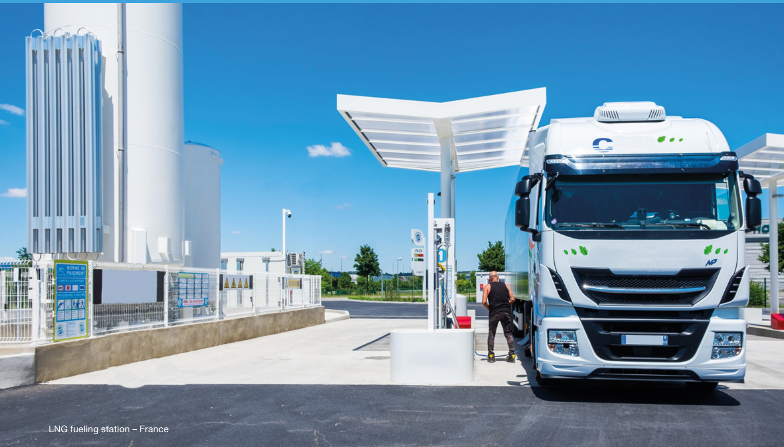
LNG fueling station – France