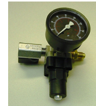
SMC Piston Style Regulators shown in color coded assemblies with gauges, and CO 2 ball valves. Gauges with stainless steel casings and color coded faces will be phased into use at a later date.