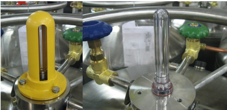
Figure 1 - The left view shows the yellow protector used for the Sight Gauge liquid level system. The right view is the actual sight gauge. The protector slips over the top of the sight gauge and is bolted to the plumbing manifold.

Chart Parts will continue to offer replacement parts for the sight gauge design for the foreseeable future. However, if an entire sight gauge float assembly needs to be replaced, we recommend that you transition to the comparable Roto-Tel assembly which is sold by Chart Parts. If you have questions regarding this change, please contact Chart Customer Service at 800-400-4683. Thank you for choosing Chart products!