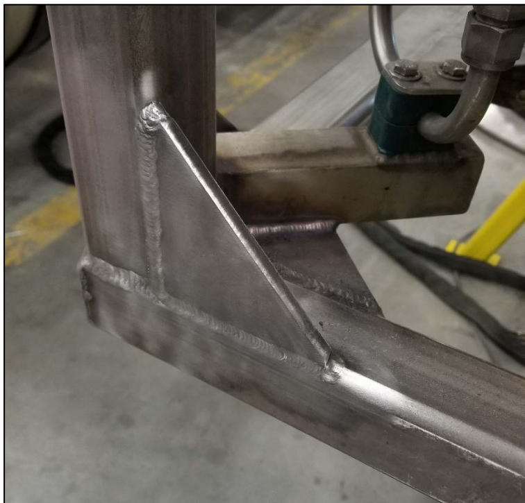
Installed frame reinforcement gusset example