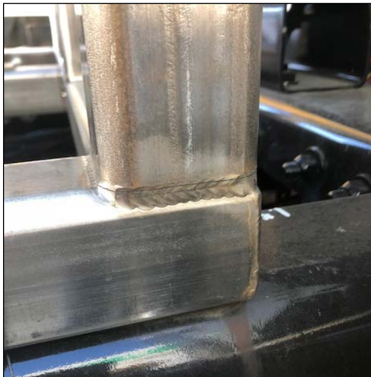
Frame weld breakages example