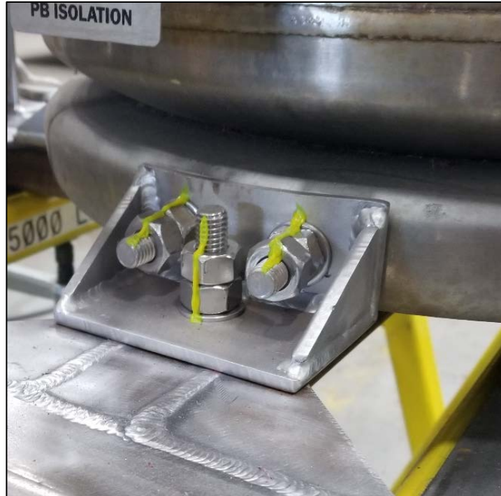
Installed frame reinforcement gusset and tamper indicating paste example

4. If crack is noticed, take out of service for weld repair. Contact Chart for delivery assist frame reinforcement kit (21348715).