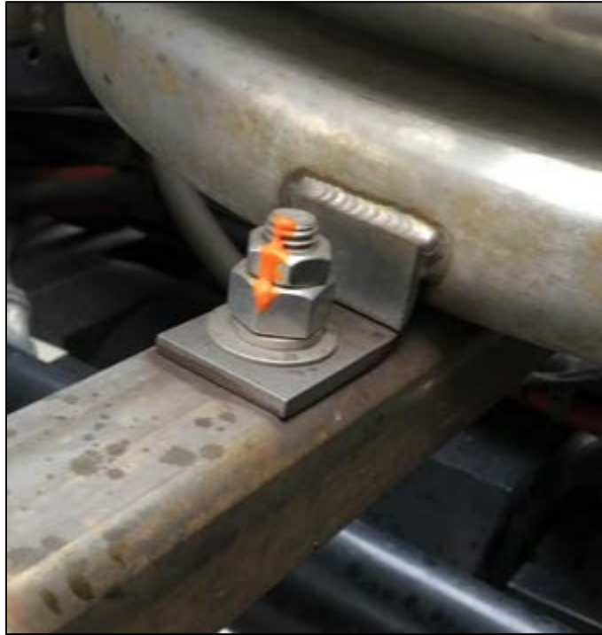
Tank to frame breakage example