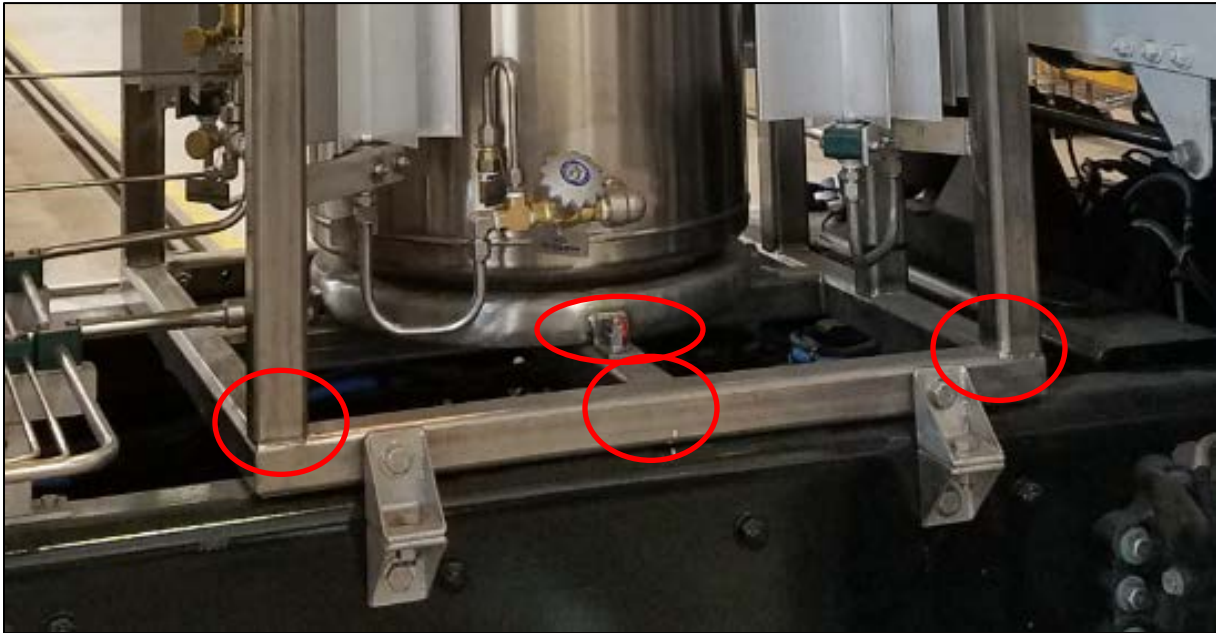
Daily pre-trip visual inspection points