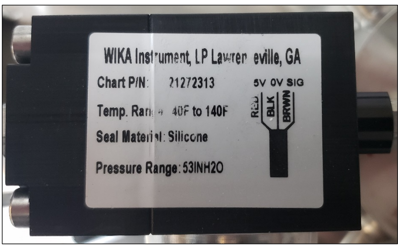
Figure 4. Wika DP Gauge Telemetry Wiring Schematic

The part number table below shows information regarding what new Wika DP gauge part numbers are replacing the old Orange Research DP gauges.