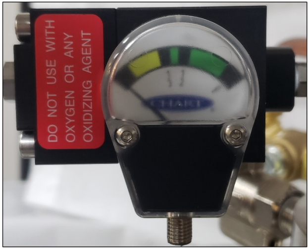
Figure 3. Wika DP Gauge With Telemetry