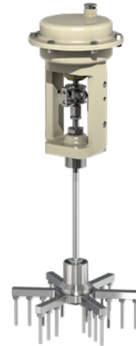
Example of rolled diaphragm style with finger unloader