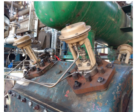
CPI diaphragm unloader actuators with upgraded seals which reduced their emissions and improved their reliability