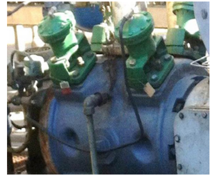
A refinery customer experienced problems with gas leakage from their OEM old style diaphragm unloader actuators

They provide an upgrade opportunity for both old style valves and unloaders or as part of normal reconditioning service.