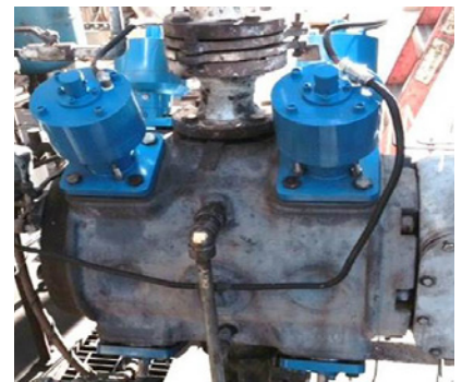
CPI plug unloader actuators with upgraded seals which reduced their emissions and improved reliability