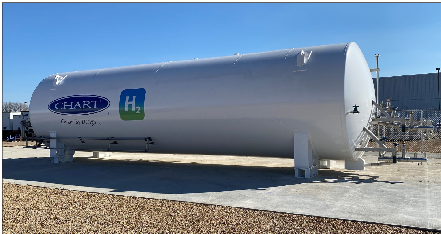
Chart Inc. U.S. : 1-800-838-0856 Worldwide: 1-952-243-8800