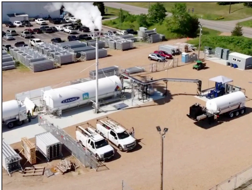
Chart offers a wide variety of stations from small, self-contained stations to large custom stations that provide liquid hydrogen dispensing for any size vehicle fleet. Our stations are engineered for single-hose, no loss filling and auto shut-off with our liquid hydrogen of LH 2 vehicle tanks. This patented submerged pump, controls and vehicle tank system provides the operator with the simplest and safest liquid hydrogen fueling process available today.