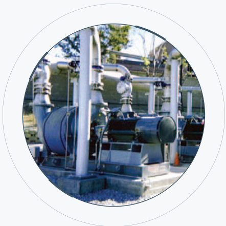
Three Spencer Power Mizer Series 7000 blowers supplied with Heresite® coated internal parts are installed at a California municipal landfill gas facility for handling extremely corrosive and combustible gases.

After devoting more than 165 years to air and gas handling equipment, Howden is respected worldwide for its value-added services and quality products.