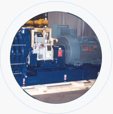
Spencer Power Mizer blowers for installation at an Indonesian plant feature two special drive configurations: one has a steam turbine power source; the other has a motor and gear increaser for use with 50 Hz electricity.