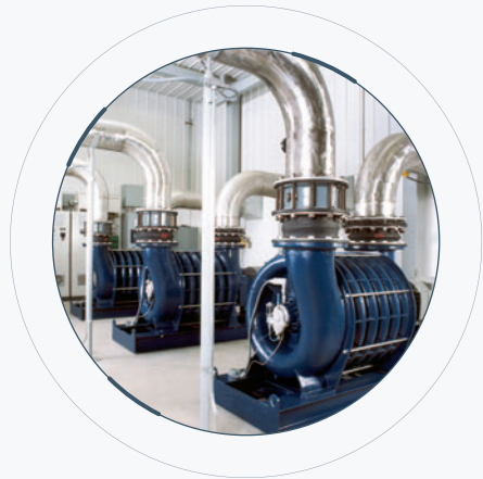
A bank of three Spencer Power Mizer blowers operating in parallel for wastewater aeration at a large wastewater treatment plant.