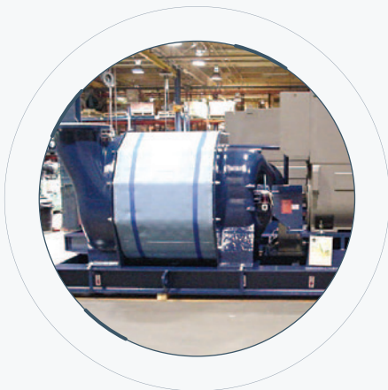
Massive Spencer Power Mizer Series 7000 blower with Acoustical Belly Wrap™ ready for shipment to China for a municipal wastewater aeration application.