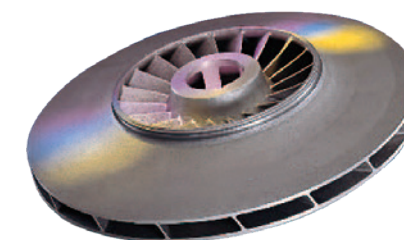
Cast aluminum impeller.

Howden's exacting balancing procedures produce an overall vibration level of 0.19 in/sec or less for Series 2500 to 7000. This decreases bearing stress, which improves bearing life and blower reliability.