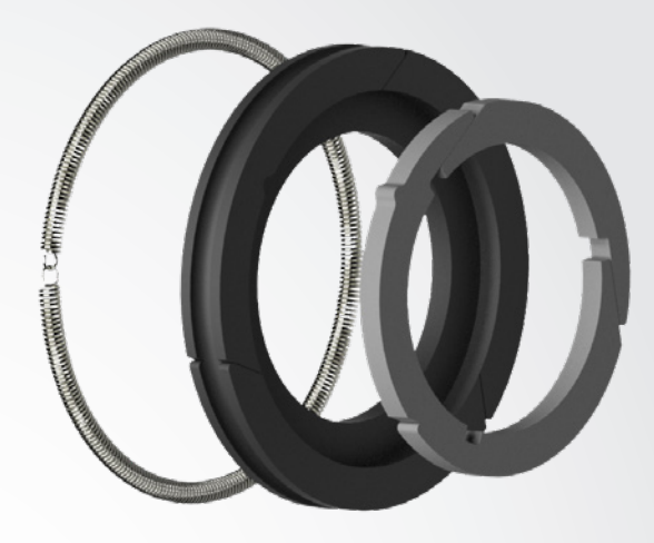
Exploded view of a double acting EMISSIONGUARD TR<sup>2</sup> packing ring

*The CPI EMISSIONGUARD TR<sup>2</sup> is patent pending