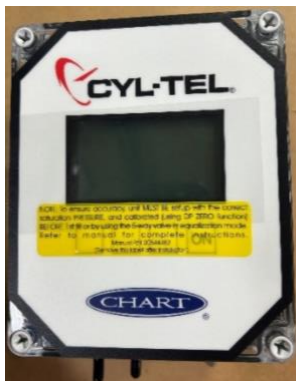
Figure 1: Current - 20910598