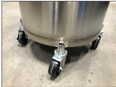
Old Flat Bottom Design

Subject: Effective approximately 11/1/21, the base of the Dura-Cyl 120LP models is being changed to a square base design from the current flat bottom design as shown in the following pictures.