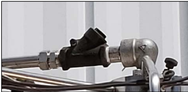
Previous Check Valve