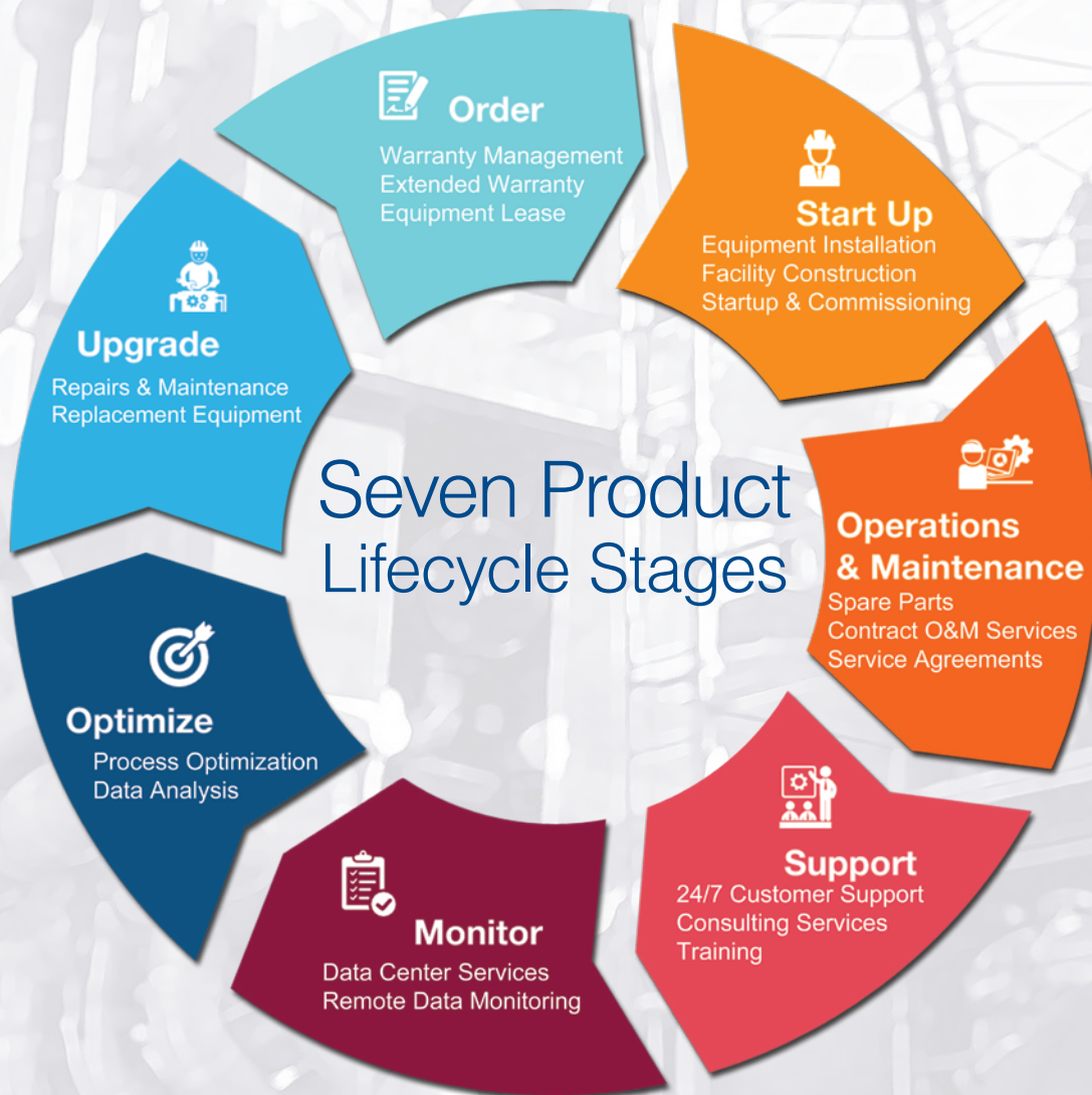
Chart offers a level of service through the entire lifecycle of our products that is unique, and unparalleled in the markets we serve. Through the identification of 7 product lifecycle stages we build relationships with plant stakeholders, from process and mechanical engineers through to operation and maintenance personnel, focused on the optimized performance and lifespan of Chart proprietary equipment.

Chart's mission critical equipment – brazed aluminum heat exchangers and air cooled heat exchangers – is at the heart of the cryogenic processes used in natural gas processing, LNG, petrochemical processing and industrial gas production.