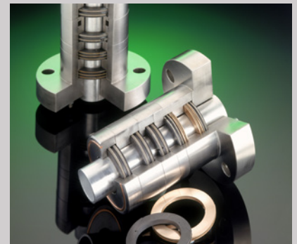
Packing case without cooling