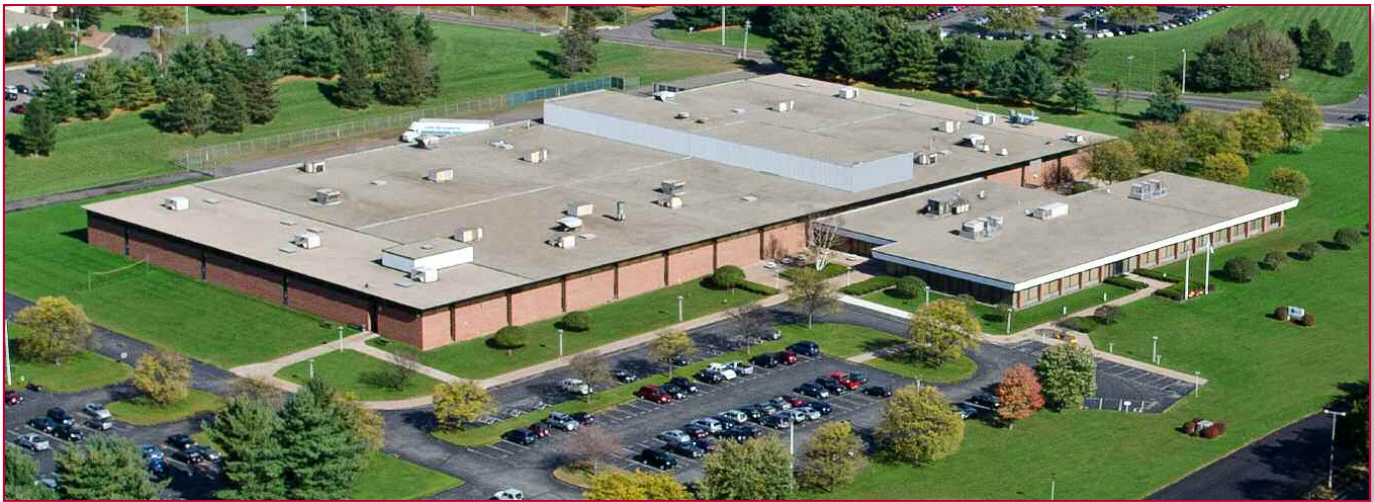
Spencer Corporate Headquarters and Manufacturing Plant, Windsor, CT USA

Application studies, product development and testing programs are conducted by in-house professional engineers. More than a century of air and gas handling expertise has created a unique capability for high-efficiency, cost-effective solutions.