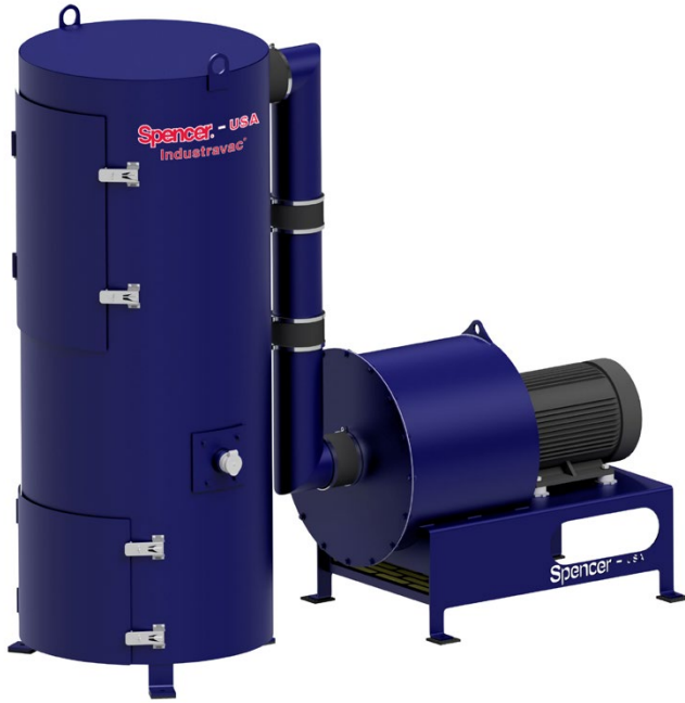
Industravac® Series E Vacuum Producer and Separator components interconnected with piping. (Note: Components ship in (3) pieces.)