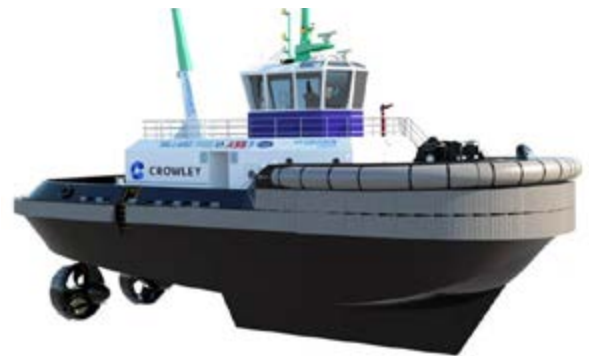
HyZET — Hydrogen Zero Emission Tug

Chart Marine is proud to be a consortium partner working to develop the first hydrogen fuel cell-powered harbor work boat, HyZET-Hydrogen Zero Emission Tug. The maritime fuel cell design and feasibility study for the commercial harbor craft is funded by the California Energy Commission (CEC).