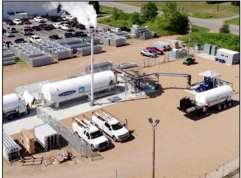
Chart offers a wide variety of stations from small, self-contained stations to large custom stations that provide liquid hydrogen dispensing for any size vehicle fleet. Our stations are engineered for single-hose, no loss filling and auto shut-off with our liquid hydrogen of LH 2 vehicle tanks. This patented submerged pump, controls and vehicle tank system provides the operator with the simplest and safest liquid hydrogen fueling process available today.