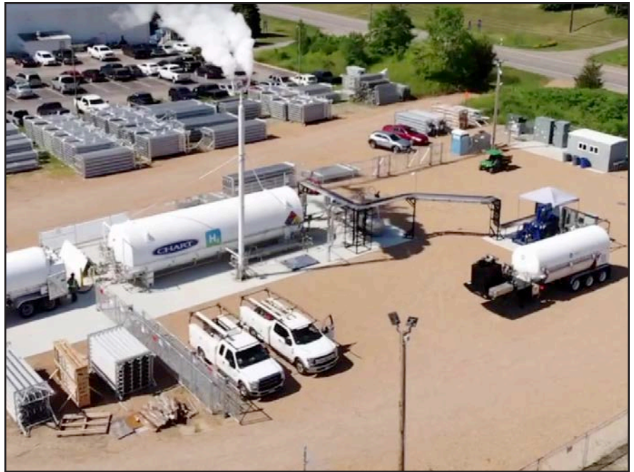
Chart offers a wide variety of stations from small, self-contained stations to large custom stations that provide liquid hydrogen dispensing for any size vehicle fleet. Our stations are engineered for single-hose, no-loss filling and auto shut-off with our line of HLH2 vehicle tanks. The submerged pump, controls and vehicle tank system provide the operator with the simplest and safest liquid hydrogen fueling process available today.