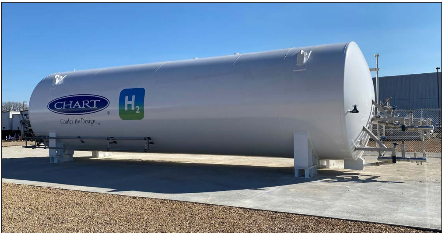
Chart Inc. U.S. : 1-800-838-0856 Worldwide: 1-952-243-8800