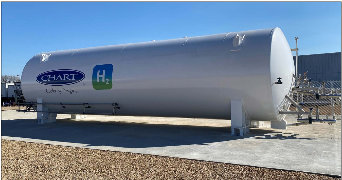
Chart Inc. U.S. : 1-800-838-0856 Worldwide: 1-952-243-8800