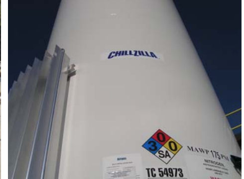
ChillZilla<sup>®</sup> 11,000 gal. with high flow 40 gpm vaporizer and 2" VIP withdrawal