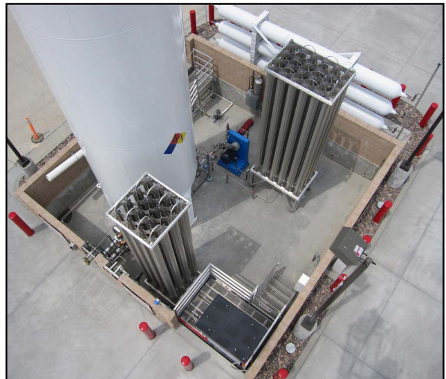
Chart Inc. U.S. : 1-800-838-0856 Worldwide: 1-952-243-8800