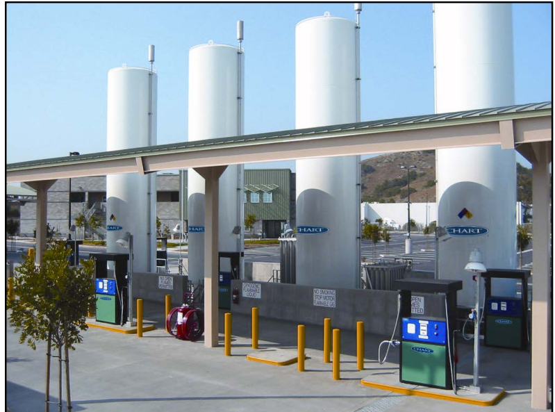
Chart offers a wide variety of stations from small, self-contained stations to large custom stations that provide both LNG and LCNG dispensing for any size vehicle fleet. Our stations are engineered for single-hose, no loss filling and auto shut-off with our LNG vehicle tanks. This patented submerged pump, controls and vehicle tank system provides the operator with the simplest and safest LNG fueling process available today.