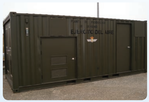
AS-J250-HPCR Containerized High Purity Packaged PSA Oxygen Plant for the Spanish Military — Spain