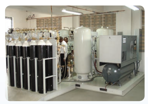
AS-J450-HMFM Duplex PSA Medical Oxygen Plant — Kenya