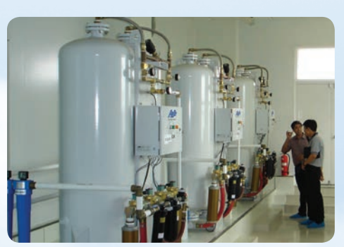
AS-K900-HM Triplex PSA Medical Oxygen Plant — China