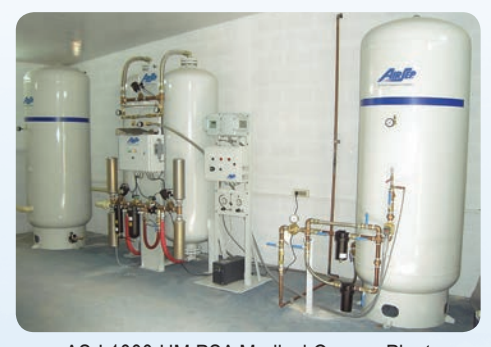
AS-L1000-HM PSA Medical Oxygen Plant — Uruguay