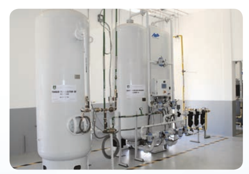
AS-Q2600-HM Duplex PSA Medical Oxygen Plant — Nicaragua

AirSep Medical Oxygen systems can be fabricated in accordance with all relevant local codes (e.g., ASME, ANSI, NEMA, CSA, CRN, CE/PED, TSG R0004-2009, HTM2022, ISO 9001, ISO 13485, ISO 10083, and USPXXII Medical Oxygen Standards).