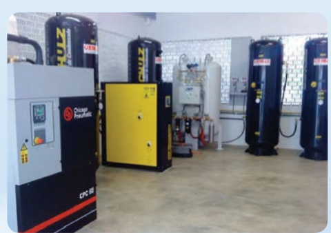
AS-K750-HM PSA Medical Oxygen Plant — Brazil