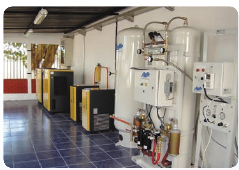
AS-G300-HM PSA Medical Oxygen Plant — Uruguay