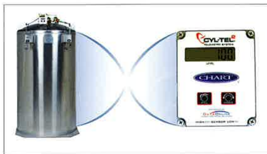
Cyl-Tel 2 with upgraded DataOnline cell radio for MicroBulk telemetry

For more information visit www.microbulk.com or www.dataonline.com . □