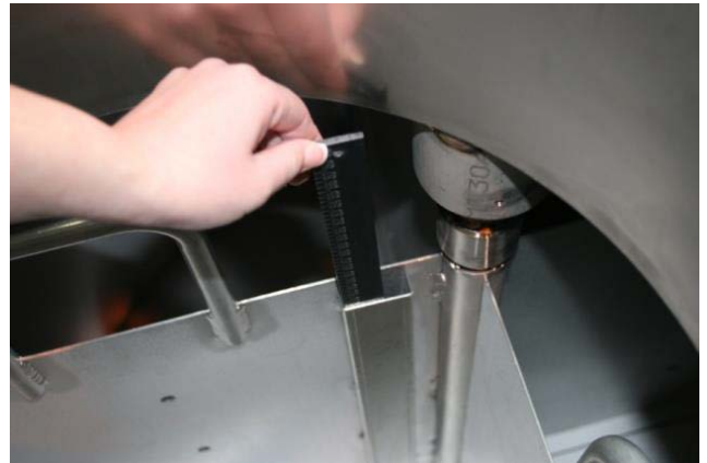
Above: Level dip stick inserted to measure the physical liquid nitrogen level

NOTE: Liquid level calibration is most accurate when calibrated at 10.0 inches (254 mm). Calibration must be performed above 3.0 inches (75 mm).