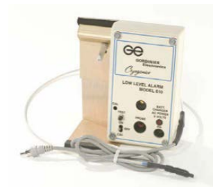
Therm-O-Lert Battery LN2 Level Alarm (230 V): PN 10769489 Therm-O-Lert Battery LN2 Level Alarm (110V): PN 9710879