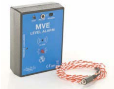
Low Level Alarm: PN 11905817 (BAT1-B)

Chart sells a low level alarm for our aluminum Dewars that is designed to alert when the level of LN2 in the Dewar is decreasing. The Low Level Alarms include a probe that is inserted through the neck and placed at a user-designated level. When the level of the LN2 goes below the probe, the alarm will sound. Chart sells two variations of these alarms. The Bat 1B alarm uses a 9V battery for power. The Therm-O-Lert uses an 110V or 230V AC supply as well as an internal, rechargeable battery.