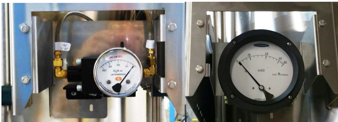
Current Orange Research LL Gauge

The new Wika gauge has the same mounting configuration as the Orange Research Gauge. Since the Wika gauge is larger than the Orange Research gauge, a slight modification has to be made to the mounting bracket by drilling additional holes in it (see figure 1). Modified brackets will be sent out with replacement Wika gauges when required.