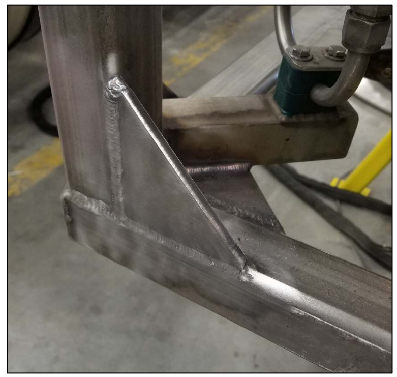
Installed frame reinforcement gusset example

Installed frame reinforcement gusset and tamper indicating paste example