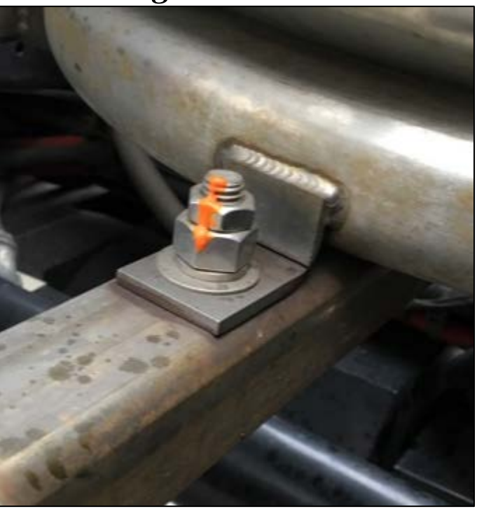
Tank to frame breakage example