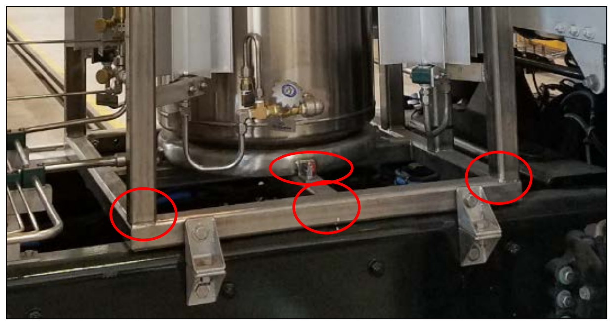
Daily pre-trip visual inspection points

3. Inspect tank support areas daily for breakage on all four sides of stainless-steel frame structure in the image below.