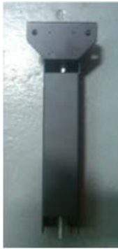
Black Hinge PN 11929579, 10842113, and 11008366