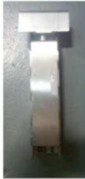
Stainless Steel Hinge PN 11933551