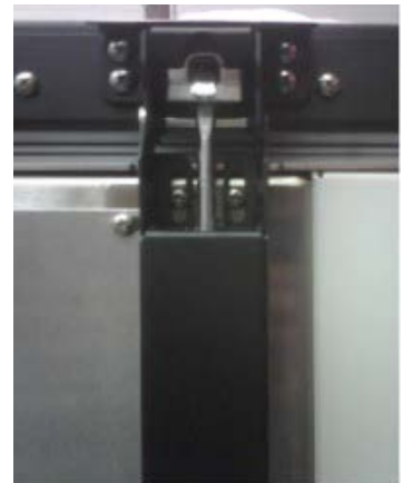
New Hinge Style

Notice the old hinge style has a flange with the screws located outside of the body of the hinge. The screws on the new hinge style were moved inside the body of the hinge. The screws are also in different locations in respect to where the hinge attaches to the lid.