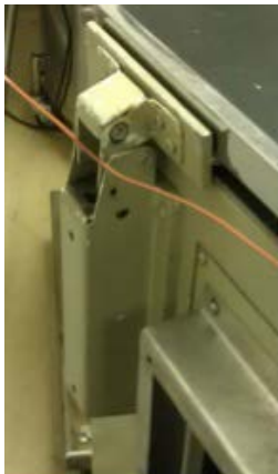
Old Hinge Style

A: Please see the below photos and take note of the screw locations.