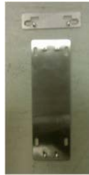
Retrofit Kit PN 11087666