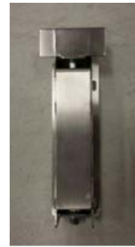
Stainless Steel Hinge with Retrofit Kit