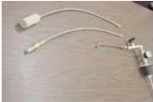
Transfer Hose for Discharge Device

As an alternative to the standard rigid spout on the manual discharge device, Chart offers a flexible, stainless steel transfer hose with either a small or large phase separator. The hose is 2 feet long with ¼ inch diameter threads.