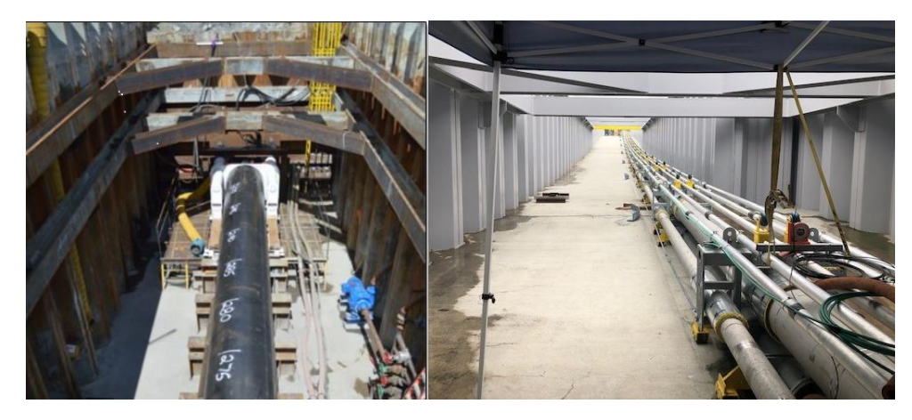
Below grade casing in construction phase