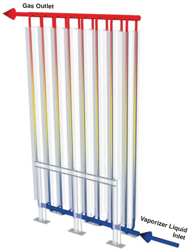
Flow Path, Vertical Configuration