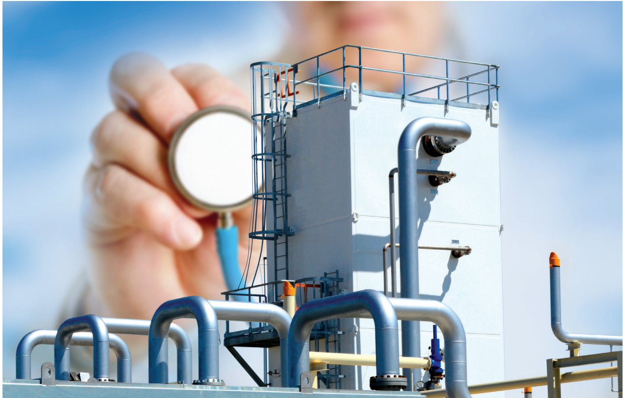
Chart continues to be the industry innovator and we strongly urge you to ask us about the following options with the purchase of your next BAHX.

“An Ounce of Prevention is better than a Pound of Cure” Benjamin Franklin