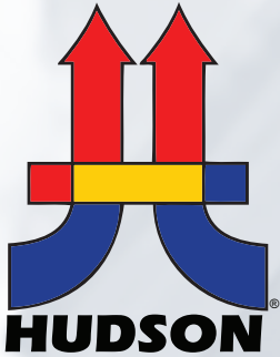
Chart Lifecycle is an OEM service provider for all Chart owned air cooled heat exchanger (ACHX) brands, including Hudson Products, Air-X-Changers, Cooler Service Company, Smithco, Hammco and associated legacy brands Happy, Amercool, Tri-Thermal, Essex, Conrad, Godfellow and Western.