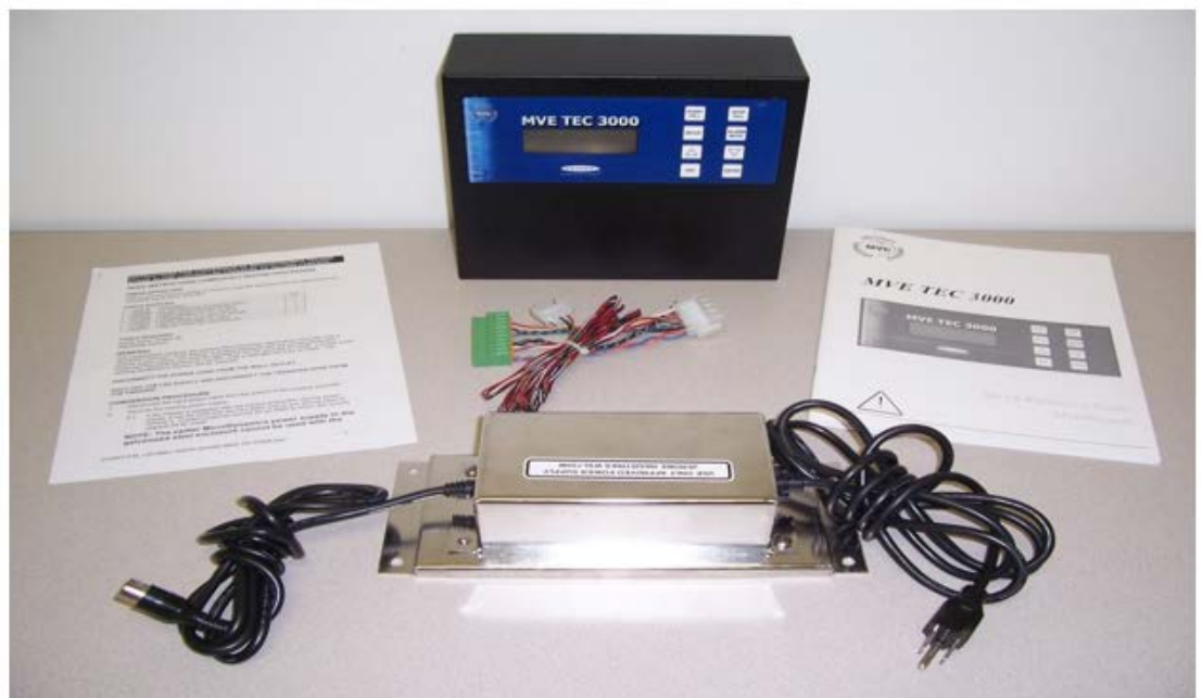
Chart provides upgrade kits that will allow freezers with the TEC2000 controller to be upgraded to the TEC3000. To order an upgrade kit, please contact our Technical Support team and provide the freezer's serial and model numbers. Technical Support will need this information in order to provide the correct upgrade kit. The most basic upgrade kit includes a new TEC3000 controller, power supply, and wiring harness adaptor. The wiring harness adaptor connects directly to the freezer's existing plumbing harness, which enables the plug-and-play upgrade.

Please Note: When upgrading a TEC2000 to a TEC3000, it is imperative to use the Jerome Power Supply included in the upgrade kit, even if the