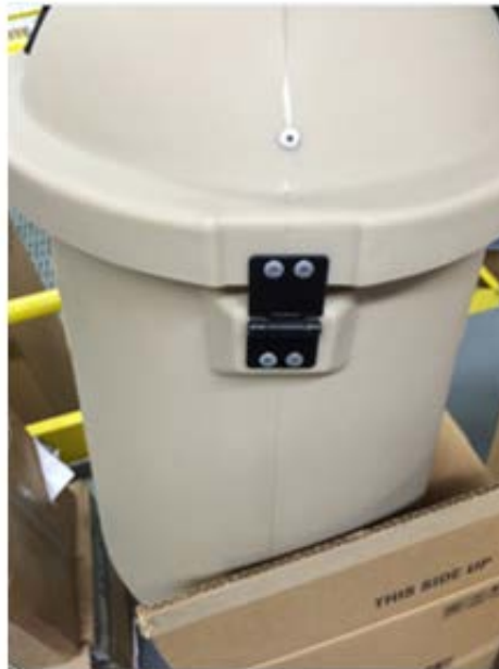
Part# 20750520 = Black hinge PN 20834268