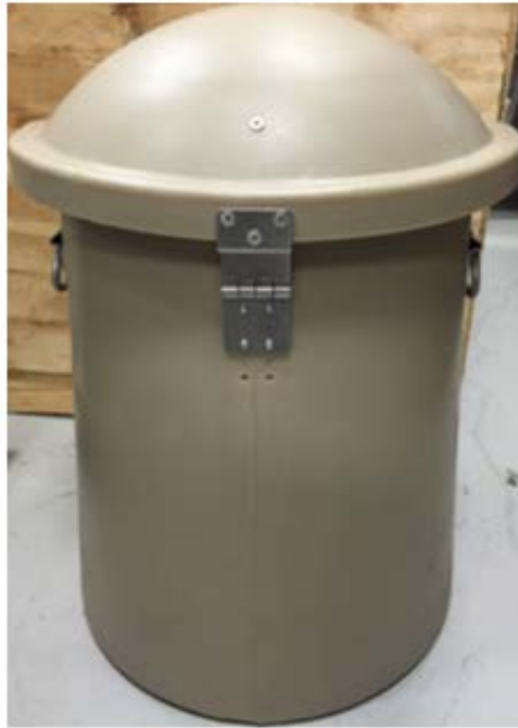
Part# 9719449 = Silver hinge PN 13960393