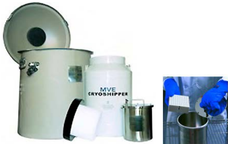
Chart MVE LN2 Tx - Liquid Nitrogen Transfer System

Chart MVE's LN2 TX is designed specifically to allow the safe and easy removal of liquid nitrogen from an open vessel. Instead of lifting and pouring liquid nitrogen from heavy dewars, one can simply utilize the LN2 TX to transfer liquid nitrogen from one open vessel to another. When connected to a nitrogen gas source, the LN2 TX will efficiently transfer liquid nitrogen.