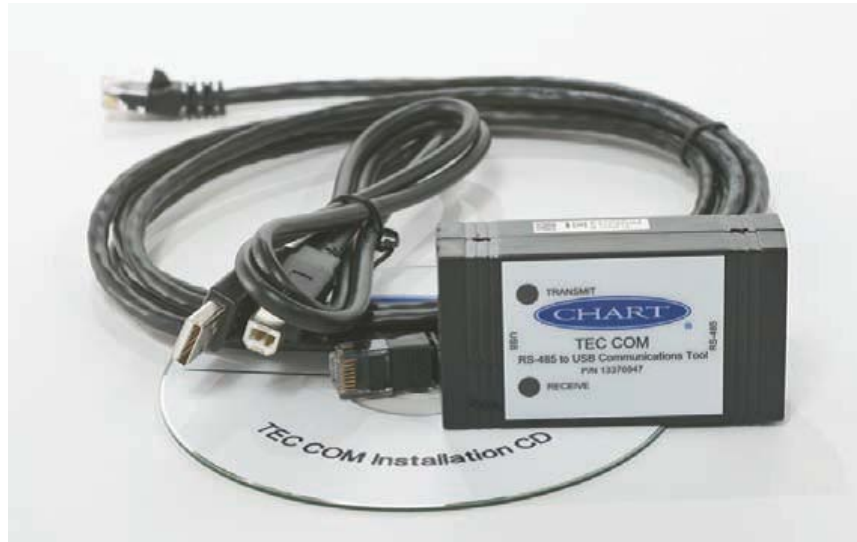
Chart TEC 2000 and TEC 3000 Connect Software is available on our website under the Distributor Marketing Services Login (Username/password is NOT required)