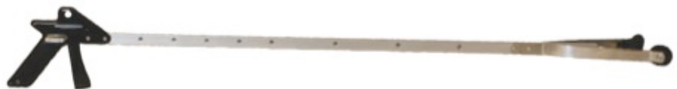
Chart sells a Cool Reach device to aid in the retrieval of items that may have been dropped into the freezer. The Cool Reach device has a reach of 40" and can be ordered using PN 13051579.