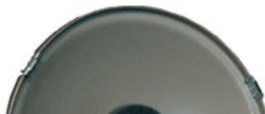
Chart offers an IATA Vapor Shipper for the safe transportation of biological samples of -150 °C or colder. IATA is an acronym for International Air Transport Association. The IATA series is the only vapor shipper Chart sells with the added benefit of a secondary stainless steel container with lid and bolts. This secondary container allows for the shipment of hazardous materials. The IATA shipper can be ordered using P/N 10777411.