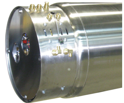
ECE R110: E4 110-R-010336 L