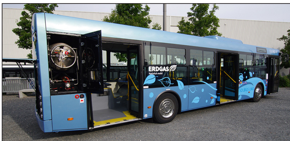
Chart designers will customize an on-board fuel system to meet your fleet vehicle needs.