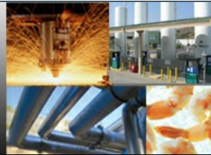
CHART INC. INDUSTRIAL GAS NEWSLETTER