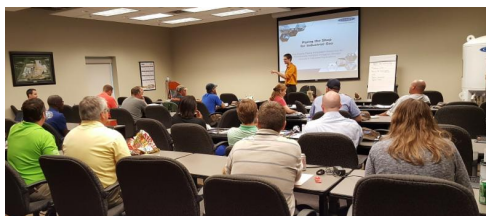
Chart Bulk Tank Tech Training New Prague, Minnesota September 2016

CLICK HERE TO VIEW TRAINING & REGISTRATION DETAILS