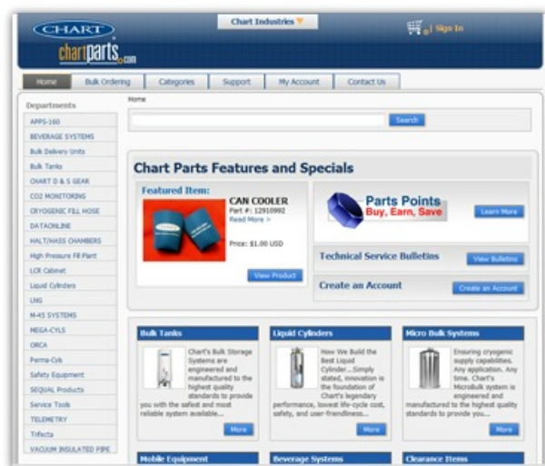
Chart will continue to enhance the product offerings and informational content on this site. Place your next parts order online, experience the changes we made, and enjoy the frequent shopper benefits of our Parts Points Program.

We are excited to announce that Chart Parts launched its NEW PARTS WEBSITE on October 9 using the same web address of www.ChartParts.com . The new site offers a new look and feel, easy navigation, an improved check-out process, and still maintains the popular Parts Points Program.