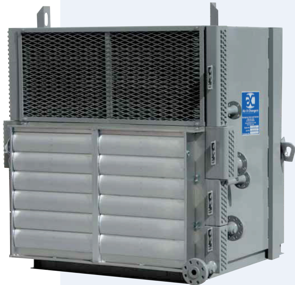
54-VI with standard core guard and optional automated main louvers