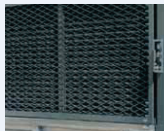
Cooling section core guard (standard)