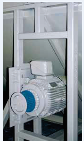
Optional electric drive