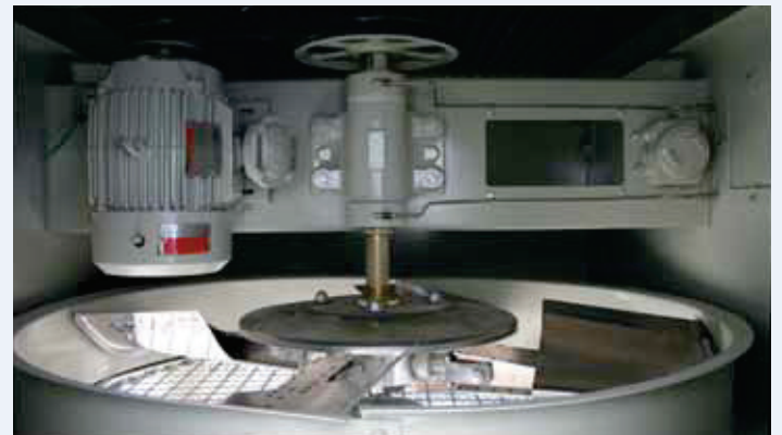
Plenum-mounted electric drive on Model HR (standard)