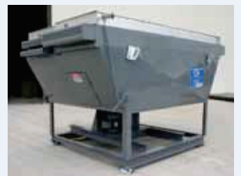
84-H with optional manually operated main louvers and additional heating coil