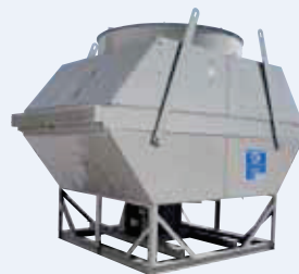
Optional warm air recirculation system