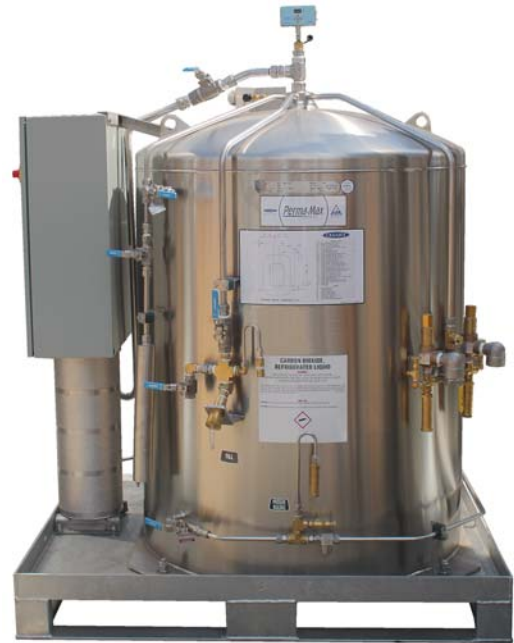
Perma-Max 1400 XHP