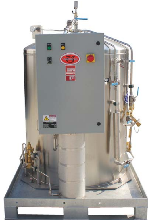
Thermax Electric Pressure Builder Vaporizer