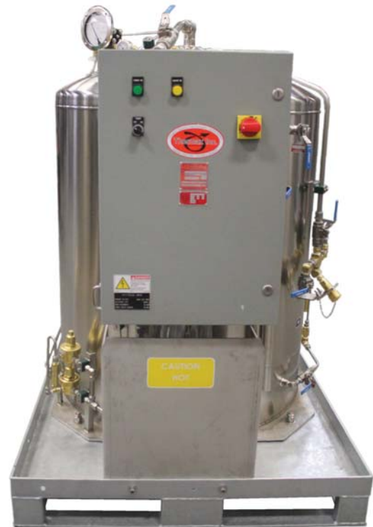
Thermax Electric Pressure Builder Vaporizer