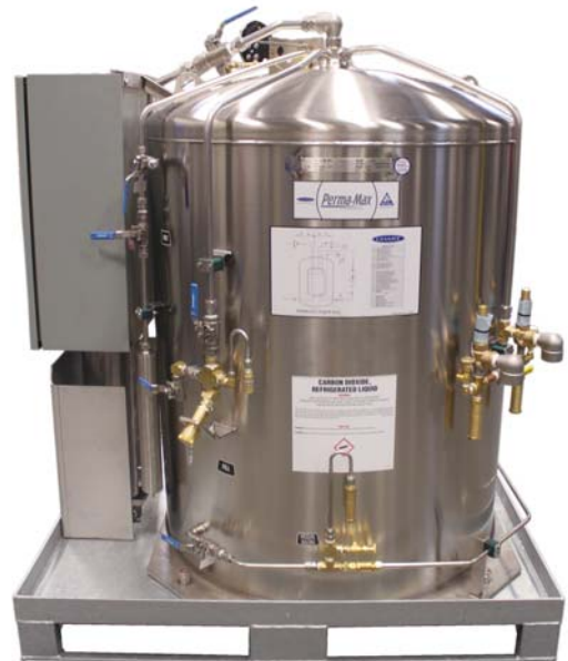
Perma-Max 1400 XHP