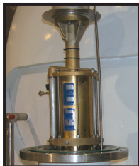
Chart Exclusive -

"Smart" flow metering system monitors flow electronically with no moving parts in meter section (standard on all models)