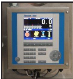
Chart Exclusive -

"Smart" flow metering system monitors flow electronically with no moving parts in meter section (standard on all models)