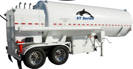
Chart Inc. U.S.: 1-800-400-4683 Worldwide: 1-952-758-4484 chart.sales@chartindustries.com