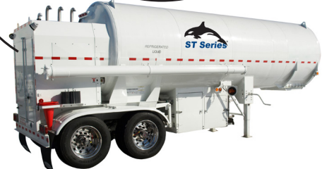
Chart Inc. U.S.: 1-800-400-4683 Worldwide: 1-952-758-4484 chart.sales@chartindustries.com