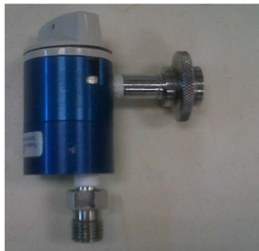
Previous Design B-701655-00

The figure below shows the visual differences between the valves.