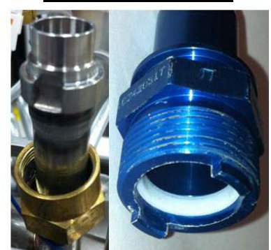
Figure 1 - - Liberator Manifold Design Change

Liberator reservoirs that contain Penox or Cryo2 top fill QDV's utilize an extension piece between the manifold and the QDV. This component raises the height of the QDV to allow for proper filling. The location and attachment of the extension is shown in Figure 2.