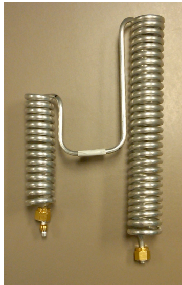
New Design #14961937

(Figure 1 - Helios Marathon Heat Exchanger Coil Change)