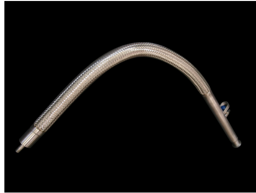
Engineer to Order Flex Pipe

Engineer to Order Vacuum Insulated Pipe flex modules allow easy configuration of your vacuum insulated pipe system around corners or obstructions, and now offer a greatly expanded array of options. Flex modules are all stainless steel coaxial vacuum insulated pipe, pumped down and sealed at the factory. Available in four standard sizes, with stainless steel flexible outer braid as standard. The modular system, joined with MVE bayonets, offers easy installation and modification, and the VIP smart numbering system allows more integrated options.