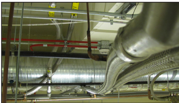
Engineer to Order Flex Pipe Installation