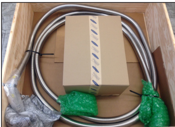
Engineer to Order Flex Coiled for Shipping