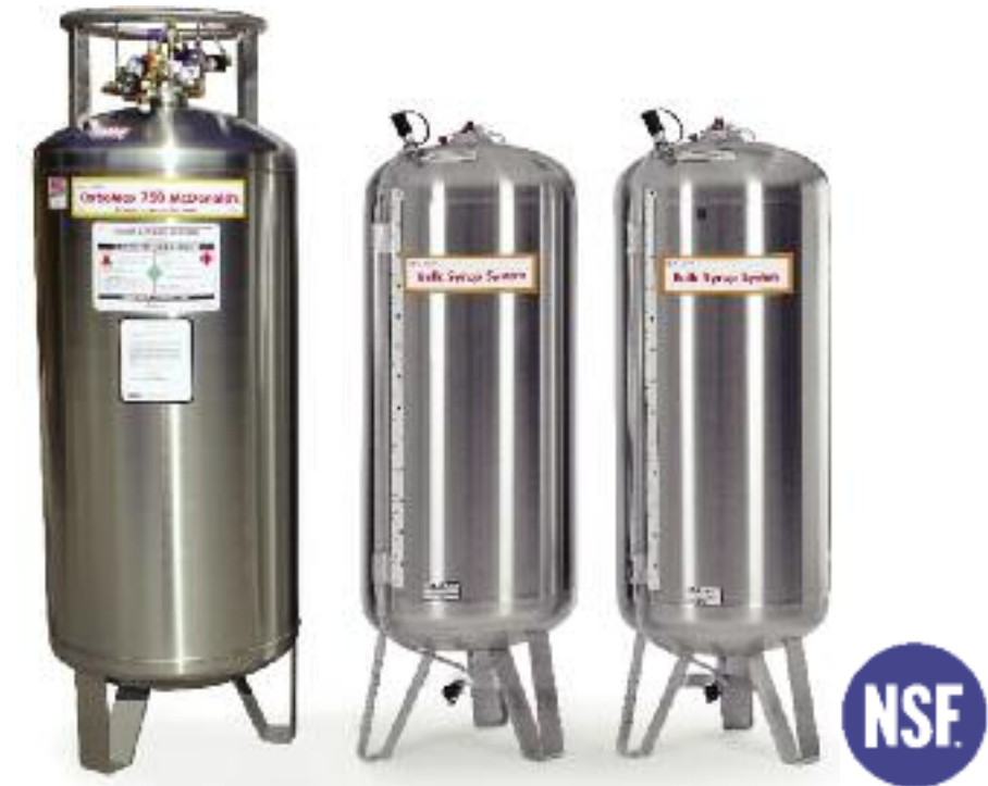
Chart Bulk CO 2

A bulk CO 2 system is a single storage vessel that provides a continuous supply of CO 2 to the beverage machine, replacing numerous high-pressure cylinders. The bulk CO 2 tank is located conveniently inside the restaurant. An average delivery time is 15 minutes, requires no crew time, and never interrupts store operations. The CO 2 delivery truck connects the hose to a fill box located outside the restaurant, and fills the bulk tank without entering the store.