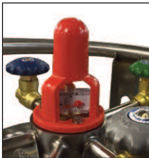
The Laser-Cyl 200L Liquid Cylinder comes equipped with the Roto-Tel ™ Liquid Level Gauge design.